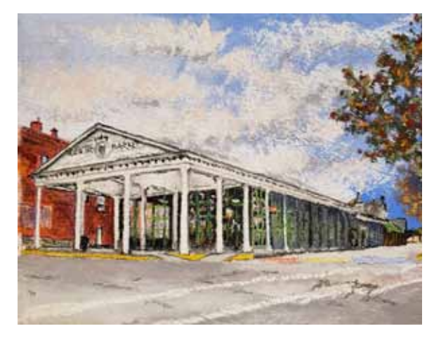
Five days of outdoor painting in the Ohio Valley region of Wild and Wonderful West Virginia